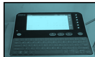
Fig.1. ECG machine

An informed consent was obtained from 50 patients as well as from normal controls. It was approved by Ethical and Research Committee SGT University. The digital 12 lead and three channels ECG machine manufactured by mindray with automatic interpretation was used for ECG recording. These were HR and intervals of PR, QRS, QT, and QTc. Intervals.