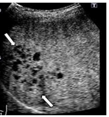
Multiple anechoic pyogenic hepatic abscesses with positive Cluster sign.