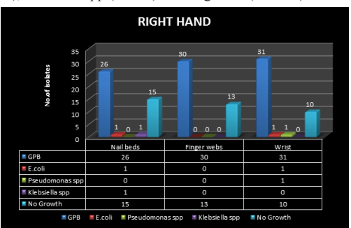
Fig.1: Graph showing no. of isolates in Right hand

The percentage of various isolates in right hand (shown in Fig.1) were GPB (67.44%), E. coli (1.55%), Pseudomonas spp. (0.78%), Klebsiella spp. (0.78%) and No growth (29.45%) and in left hand (shown in Fig. 2) GPB (65.12%), E. coli (3.10%), Pseudomonas spp (1.55%), Klebsiella spp (1.55%) and No growth (28.68%).